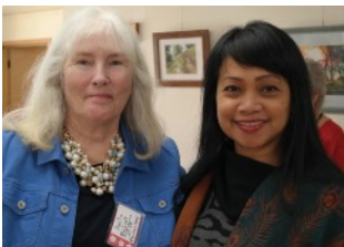
December Brunch meeting

We still have pink Woman's Club tee shirts available for purchase. They are three quarter sleeve, V-neck, wash & wear with the logo on the front left side. They cost $20. Sizes remaining are: 3-small, 4-medium, 6-large, If you'd like one of the club tees, contact Toni Kelly @ 510-304-1250.